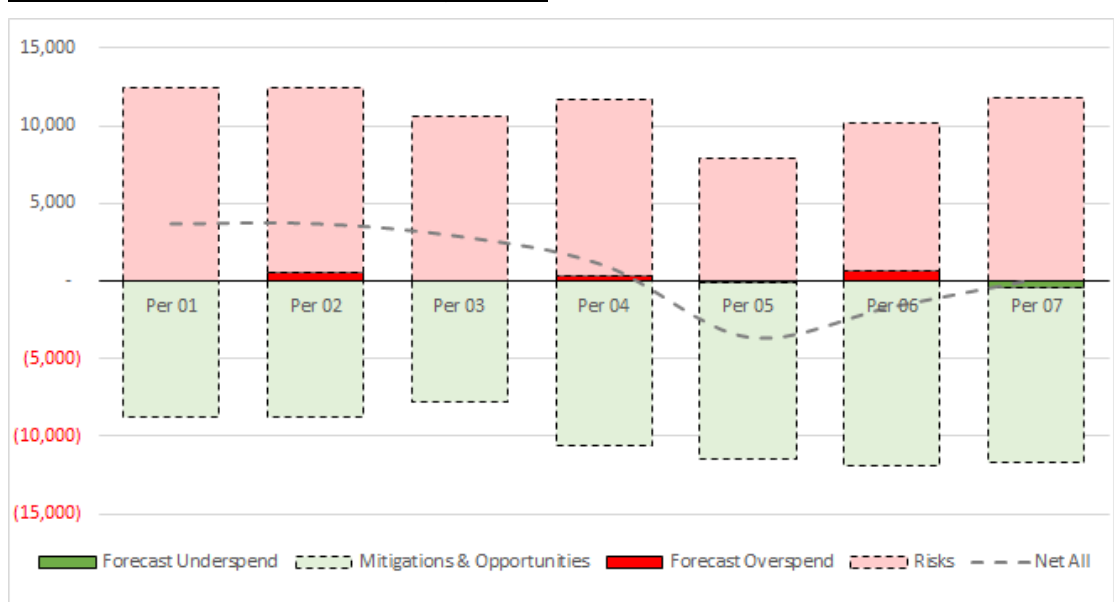
Table 5 – Revenue Forecasting Trend